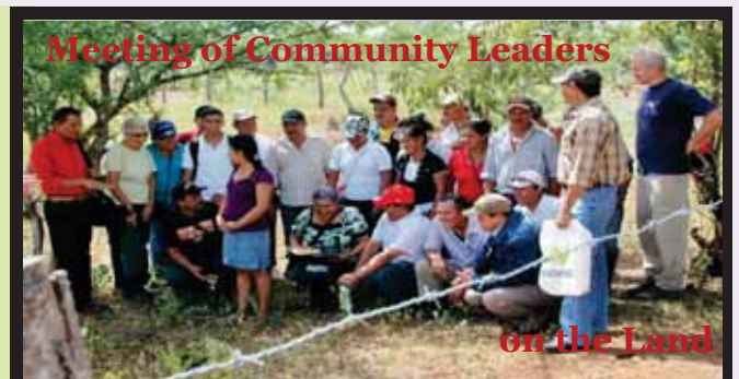
Meeting of Community Leaders