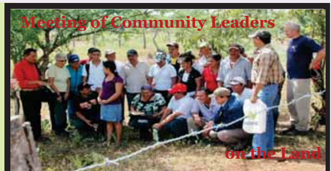
Meeting of Community Leaders