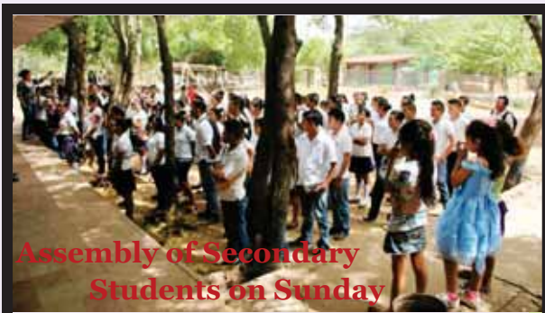
Assembly of Secondary Students on Sunday

Our updated plan is to build 2 pavilions (the basic 6 classrooms with bathrooms) in 2015. Each pavilion with 3 classrooms will cost approximately $54,000. We only have enough for 1 pavilion at present. If you understand the value of an education beyond 6th grade (primary school), please help us make this dream become a reality for 172+ students who now are squeezed into a nearby primary school on Sundays. One of the hard lessons of the long drought they experienced this year is that not all the population of rural areas can survive on farming alone, even in the best of times. Completing the secondary level of education, including learning to use computers, opens up more employment opportunities in related businesses, and serves as basic preparation for university studies.