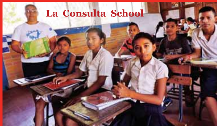
La Consulta School

Your gifts will help the next generation of children from La Consulta & Rancho Pando learn in a school with a variety of training & instructional resources. Your donation makes a difference. Mil gracias!