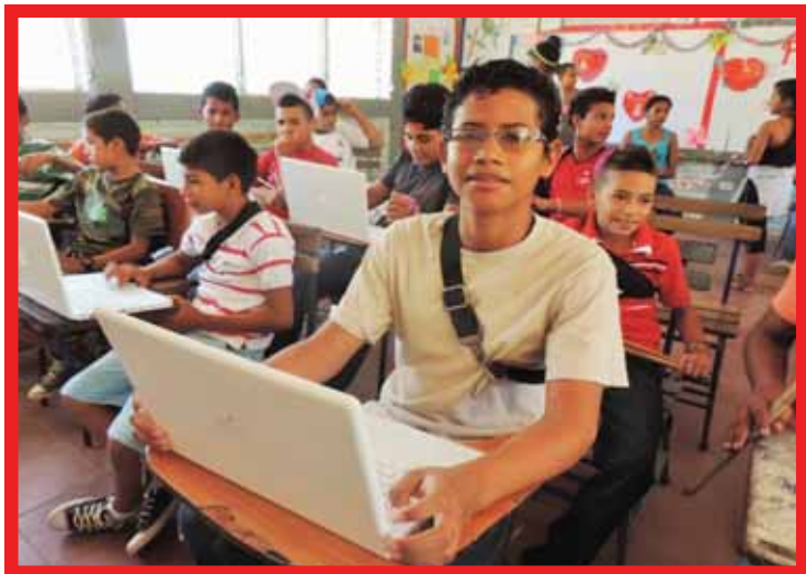
Ready & Excited about New Learning!

Although the secondary school in Rincon de Garcia introduced 2 computers to their students since 2012, the larger Instituto Nacional de Villanueva, with 800 students, has never had computers for student classes. That changed this year, with a donation of 10 (used) Mac laptop computers donated by the Bertschi School in Seattle, and 7 more (used) Dell laptops from a private donor. Excitement was high as the students thought of the possibilities opening up in front of them!