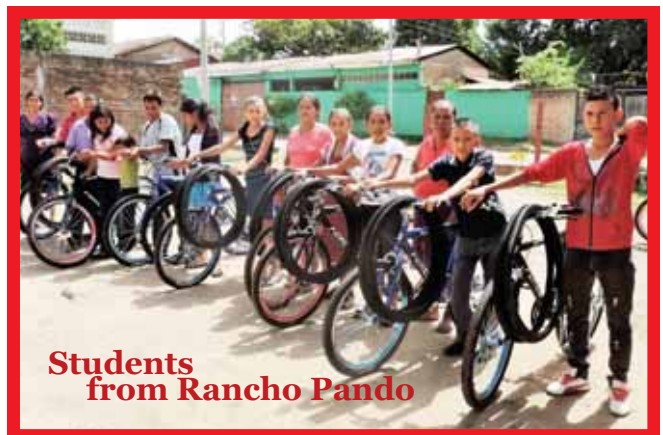
Students from Rancho Pando

The Hideaway in Kahului 500 N. Puunene Ave. November 8th, 11:30 AM-2:30PM Silent Auction & Nic. Crafts Part of the profit goes to Somos Ohana Nicaragua for the school.