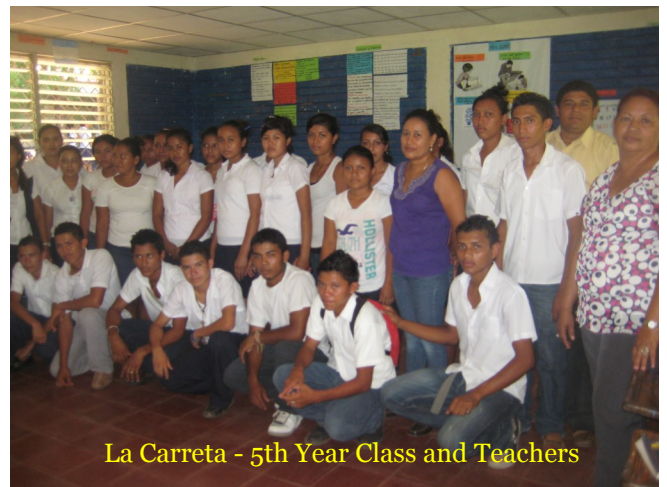
La Carreta - 5th Year Class and Teachers

Flatbread Company in Paia 89 Hana Highway September 18th, 5:00-10:00 PM Silent Auction & Nic. Crafts Part of the profit of each pizza goes to Somos Ohana Nicaragua