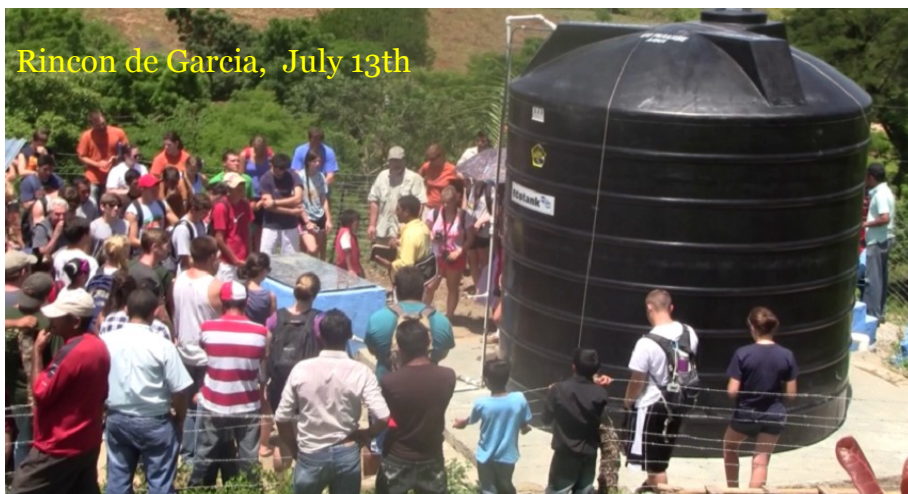
Rincon de Garcia, July 13th

When we arrived in July, it was time to celebrate their victory. July 13th, the solar-powered pump was turned on, water flowed from every home spigot, and everybody cheered! What a blessing! No need to carry 9 (5-gallon) buckets from the river or well for home needs each day; we expect notable reductions in water-borne illnesses, and improved hygiene at home and at school. Thanks to the united effort of the community, donors, volunteers, and engineers!