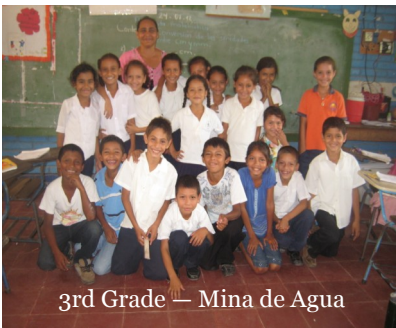
3rd Grade — Mina de Agua

When we arrived at our adopted schools, teachers were prepared with lists of needed texts and literature books. With funds from In His House of Restoration Church (Maui) & Manthala George, Jr. School (Brockton, MA), we were able to supply some of the requests from 2 high schools, 4 pre-schools, and 4 primary schools. Previously, we had not realized that the teachers' text books were antiquated, and how excited they were to receive updated texts with improved methodology consistent with their curriculum. Even more satisfying was seeing the children's faces as they devoured books they chose out of an array of inviting titles! Other than their notebooks, few have any books at home.