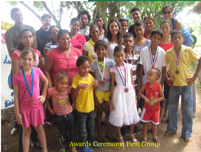
Awards Ceremony, First Group

No one fell asleep during health education! A lively team demonstrated: how to use a toothbrush, which local trees and fruits are full of vitamins and minerals, and what empty calorie foods to avoid. It's amazing what you can learn at camp!