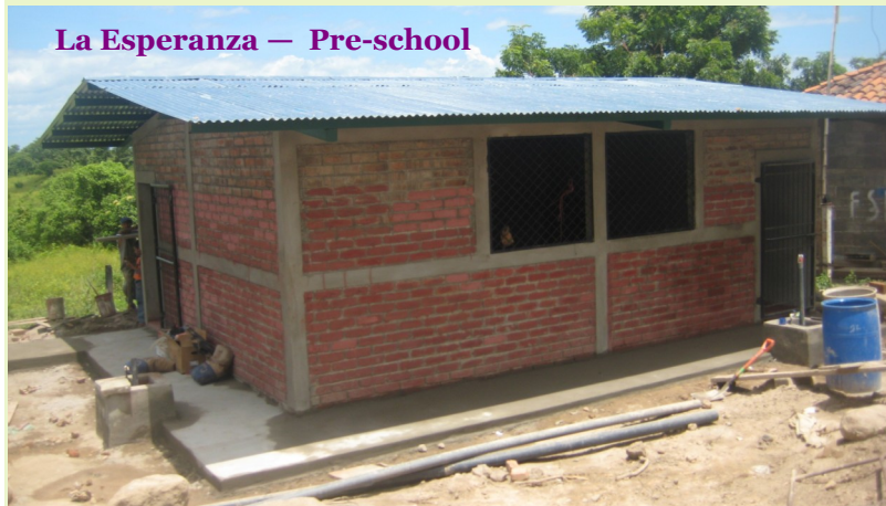
La Esperanza — Pre-school

This is a project where Somos Ohana Nicaragua partnered with Amigos for Christ. The people benefited from the guidance of an engineer from Chinandega, who designed, directed and oversaw the progress as the community contributed the manual labor.