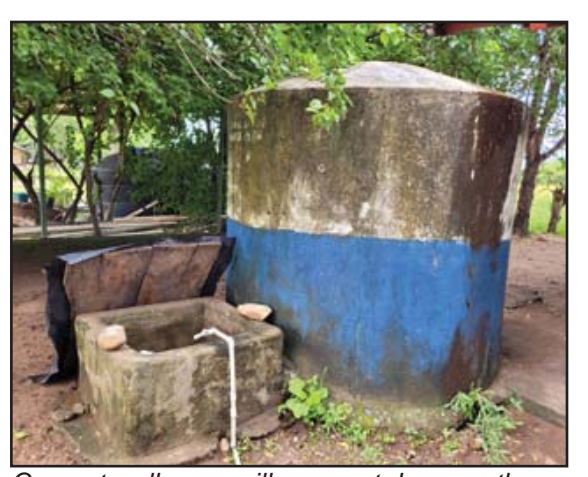
Cement walkways will soon cut down on the mud tracked into class.