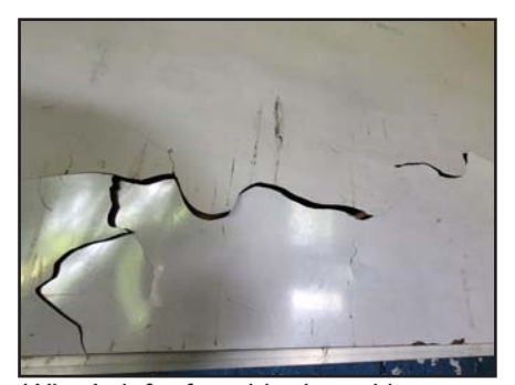
What's left of a white board in a classroom at Mata de Caña