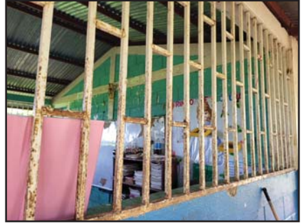
Screening will cover these windows and keep out trash, leaves and bugs.